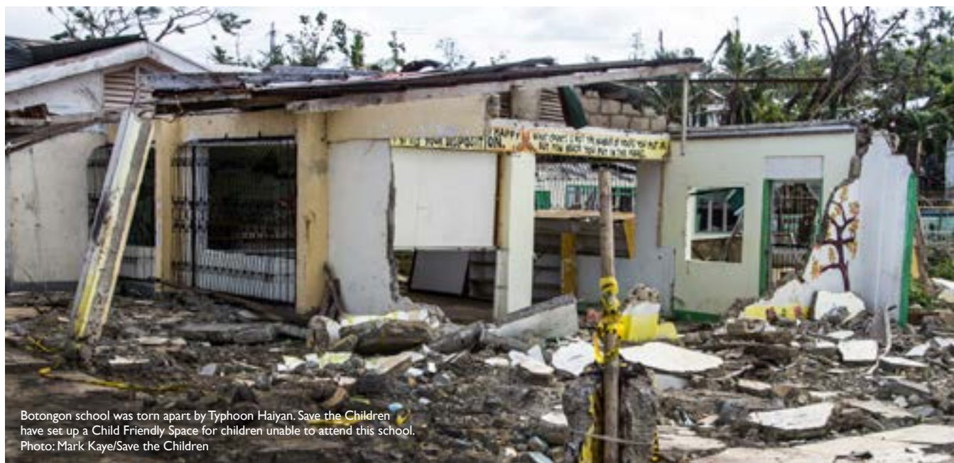
Botongon school was torn apart by Typhoon Haiyan. Save the Children have set up a Child Friendly Space for children unable to attend this school.